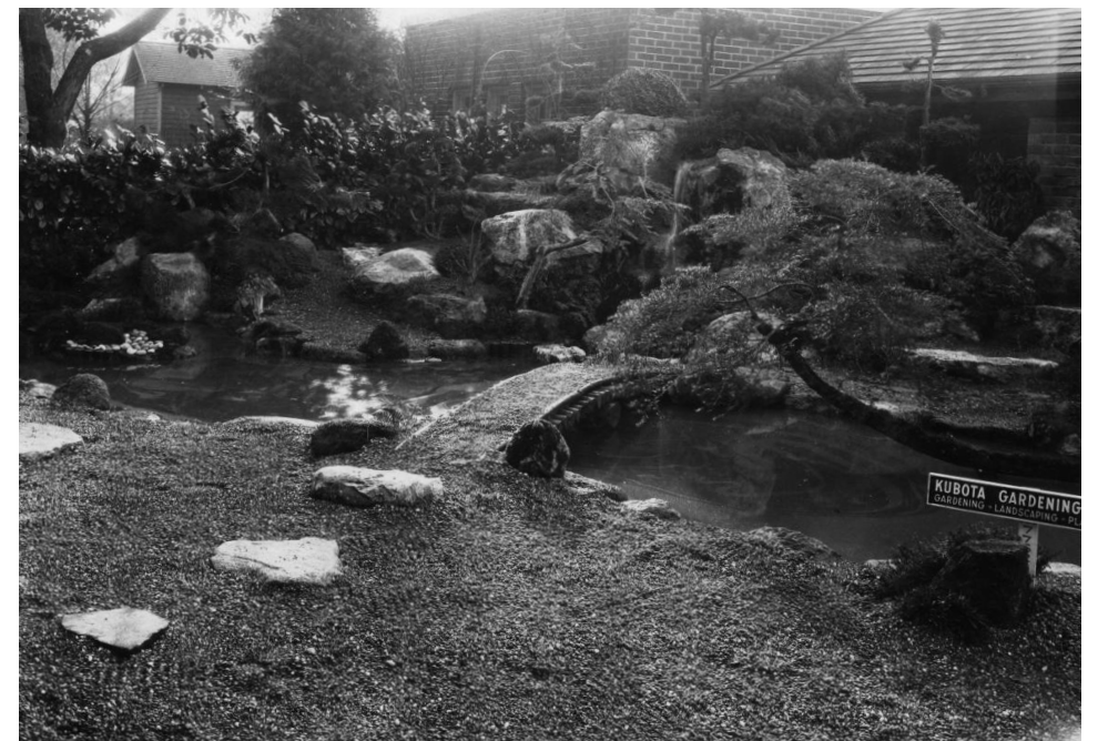
Bridge over pond in a private garden with a Kubota Gardening Company sign KGF Photo #114, dated 1926