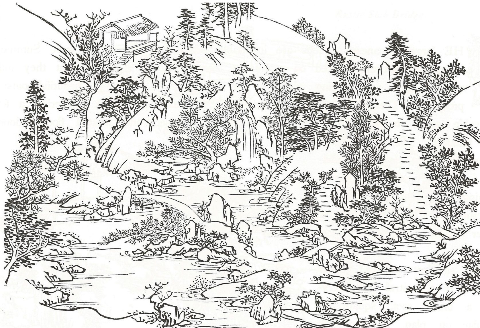
One of the woodblock prints from the Edo-period printings of Tsukiyama Teizo Den. The placement of stones on the hillside, used to support the main waterfall stone group, can also be seen in early photographs of the grand waterfall at Kubota Garden. (Source: Landscape Gardening in Japan , Figure 27, by Josiah Conder)

all mention of them would be misleading and fail to give a correct idea of their rich diversity ... they imply an important addition to the landscape artist's stock of material for designing" (Conder, 1964, 110). The list that he provided ran to 12 pages of plants names, set out in paragraph form. Unfortunately, the middle class gardens of the Edo period that would have used the plants named in Conder's list are no longer extant. In this regard, we might regard Fujitaro as the messenger for a type of Japanese garden that has been lost in the shuffle of time, a marker for an overlooked historical diversity.