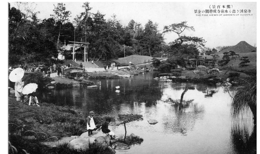
Postcard from Japan, 1920's. Japanese text reads, "(100 Views of Kumamoto); Garden of Suizen-ji Jojuen, where there is a cold mineral spring". Suizenji was the site of a feudal garden, built in the tsukiyama -style at a grand scale. KGF Photo #120, 1926