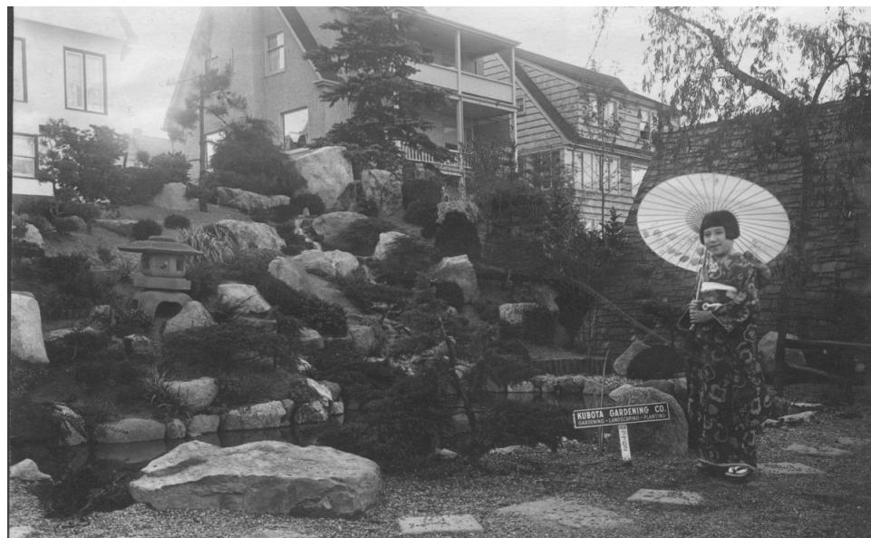
Girl in a kimono in front of Kubota Gardening Company sign