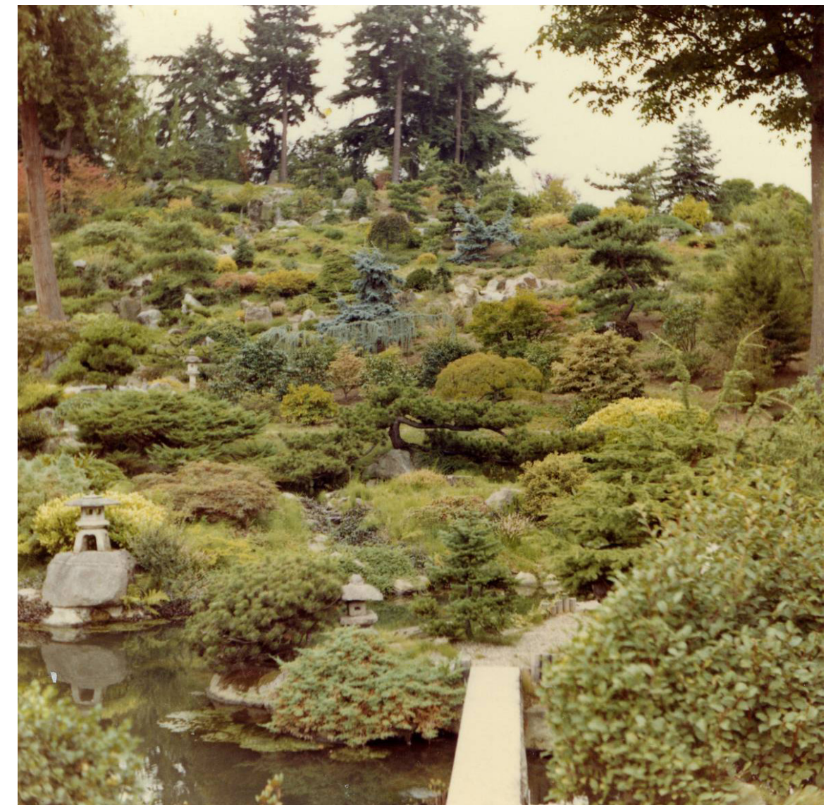
Photo of the Mountainside as viewed from the Zig Zag bridge at the Necklace of Ponds KGF Photo #574, dated 1975